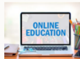
raise the opportunity for all Canadians to access the best online content

It is the idea that there should be a public service for accessing online media content and that the service should also pay firms and workers who produce the content and pay based on measured use.