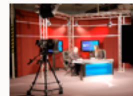
create good jobs for workers in the news and entertainment industry