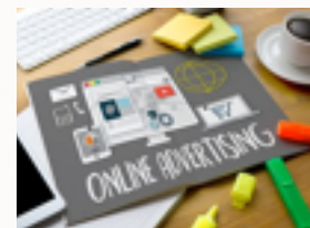
lower the opportunity to buy third party advertising