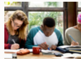
raise the level of education

Many people object to the thought of having a service that is going to require a tax increase. This objection fails to stand when it is understood that that the advertising industry which currently saves patrons from a direct expense, is creating an indirect hidden expense that is greater.