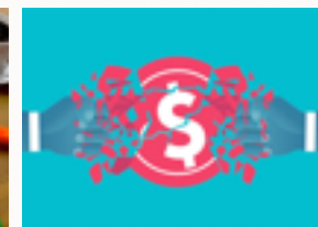
raise the opportunity for the free market to work naturally